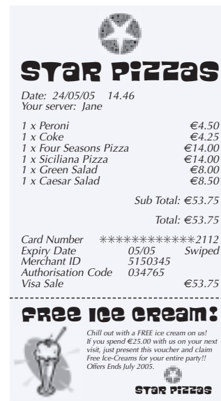
Typical example of receipt with TrueType fonts and Graphics