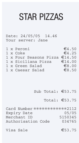
Typical example of receipt with Resident Fonts