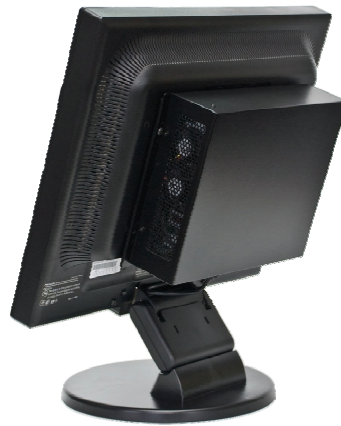
MiniBOX Rear-Mount Easily transforms an LCD monitor into a POWERFUL, LOW COST, ALL-IN-ONE SYSTEM !!!