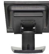
MiniBOX Rear-Mount Install with the sturdy base on an LCD touch monitor