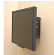
MiniBOX Wall-Mount Exclusive system to wall-mount your LCD.